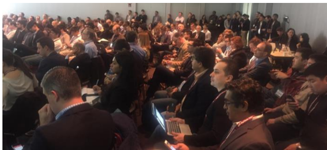
Packed and energized crowd at FinTech listen in

2016 MIT Information and Communication Technologies Conference (April 20-21, 2016, Cambridge, MA) -- The annual MIT Information & Communication Technologies (ICT) Conference explores the latest ICT research from across MIT and its potential impact across industries. This year’s conference included two sessions on Cybersecurity, along with sessions on Artificial Intelligence, and the Future of Works.