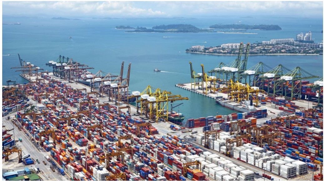
According to one sector expert, the supply chain ecosystem is not ready for the introduction of blockchain technology

"Blockchain itself might be secure, but the use of the blockchain is where all of these weaknesses come through."