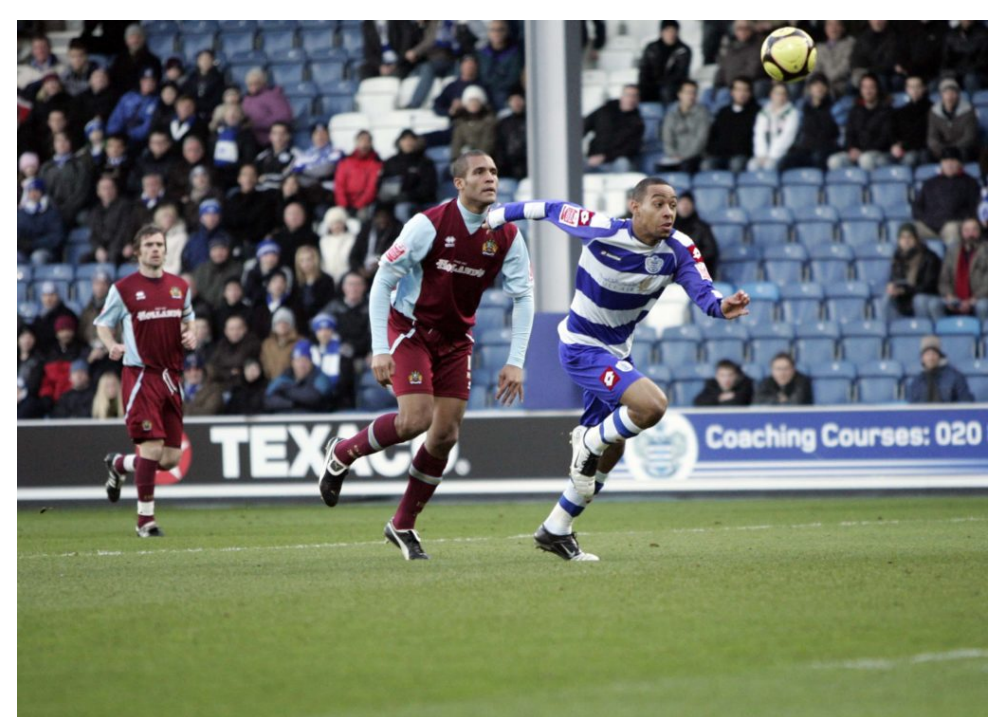
Dexter Blackstock playing for QPR against Burnley in an FA Cup tie in January 2009

Officials at a US State Council announced in March that authorities had seized more than 80 million counterfeit or faulty masks and 370,000 defective or fake disinfectants and other anti-coronavirus products, according to the <u> LA Times </u>.